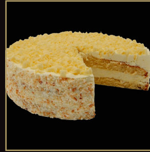
SICILIAN LEMON TORTE £4.95

Moist lemon sponge and cream flavoured with Sicilian lemon oil, finished with Belgian white chocolate.