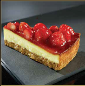
HOMEMADE CHEESECAKE OF THE DAY £4.95