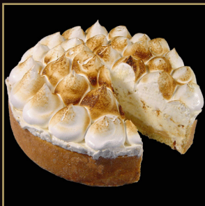
HONEYCOMB & WHITE CHOCOLATE SNOWBALL £4.95

A chocolate brownie biscuit base layered with pistachio dairy ice cream topped with grated pistachio nuts.