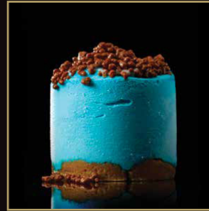
BLUE BUBBLEGUM TORTE £4.95

A toffee biscuit base layered with blue bubblegum dairy ice cream topped with chocolate popping candy.