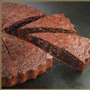
HOMEMADE CHOCOLATE BROWNIE £4.95

Moist lemon sponge and cream flavoured with Sicilian lemon oil, finished with Belgian white chocolate.