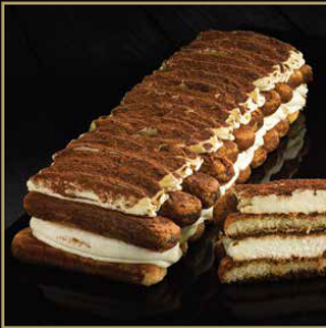
HOMEMADE TIRAMISU £4.95

A toffee biscuit base layered with blue bubblegum dairy ice cream topped with chocolate popping candy.